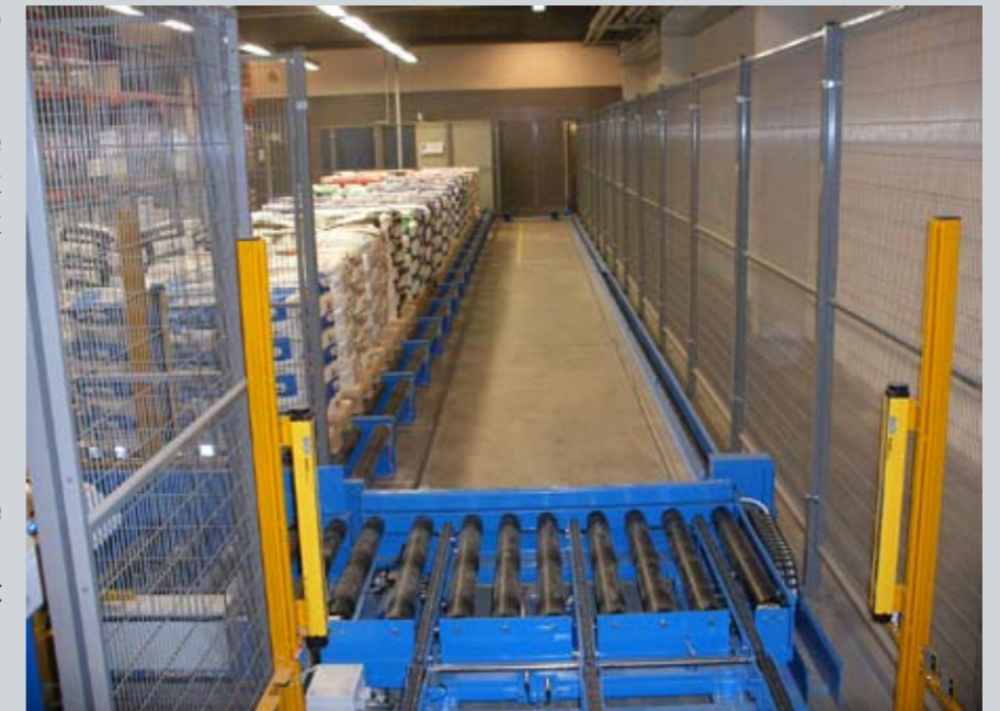
The transfer cart stands ready to receive another pallet to be fed into the order picking system.

Today the order picking system starts up a few hours before the start of the working day meaning that pallets with orders are ready for removal when the staff shows up.